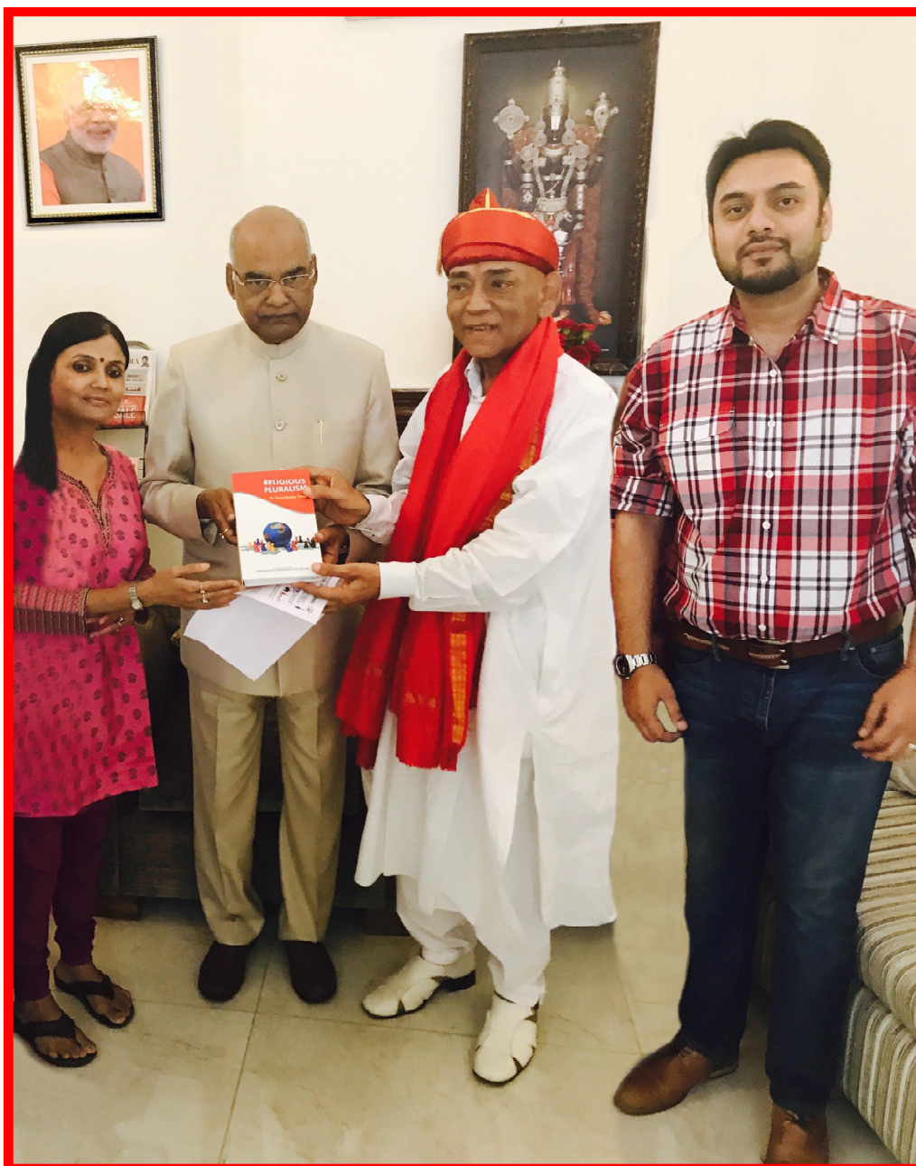
The Hon'ble President of India Shri Ram Nath Kovind receiving the first copy of his Book brought out by the IGTAMSU Team

Created under the provisions of the Indira Gandhi Technological and Medical Sciences University Act 2012 (Act 6 of 2012) of the Government of Arunachal Pradesh, this university is recognised by the University Grants Commission (UGC) Ministry of Human Resource Development (MHRD), Government of India. The School of Nursing established by the University is also recognised by the Indian Nursing Council.