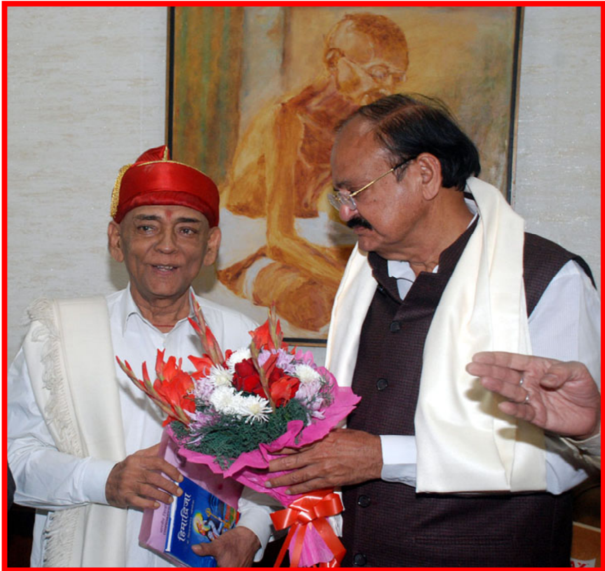
2018 : Hon'ble Vice President of India Mr. M. Venkaiah Naidu with Dr. P R Trivedi

Recognising that young people have a positive contribution to make to society, we support representation from young people at all levels of Government. Young people must not only play a central role in formulating those policies which affect them, but they should be included more widely in general policy formulation.