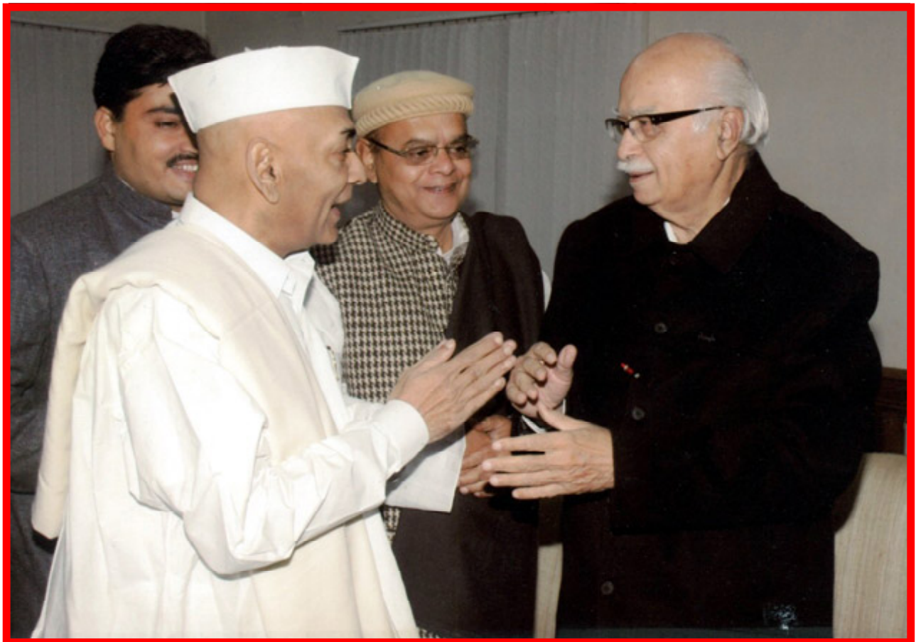
2002 : Dr. Priya Ranjan Trivedi meeting the then Deputy Prime Minister of India Hon'ble Shri L.K. Advani briefing him regarding the vast potential regarding the overall development of Arunachal Pradesh