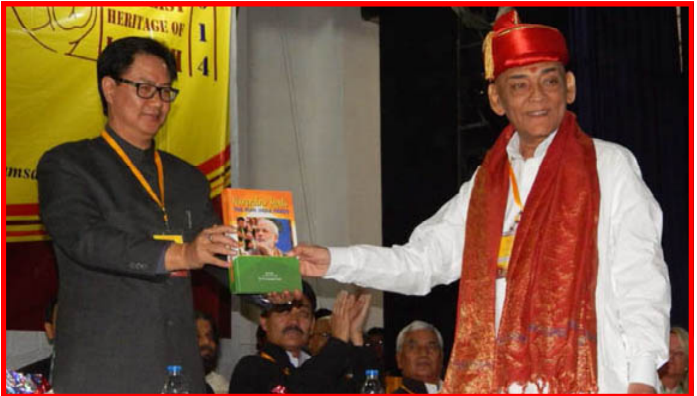
2014 : The Book titled "Narendra Modi : The Man India Needs" authored the Founder Chancellor Dr. Priya Ranjan Trivedi being released by the Union Minister of State for Home Affairs, Government of India : Hon'ble Mr. Kiren Rijiju at Leh Ladakh

The most significant feature of education for mother earth protection in the 21 st century is not so much what the French call li explosion scolaire (i pupil explosion), but the knowledge explosion, which has expanded the catchment areas of learning so fast that it takes only a decade now for the state of the art in any field to become obsolete. Different modes of communicating for advancement of knowledge are fast changing and becoming more sophisticated. In this technological era knowledge can be dispensed technologically and electronically. Teachers and formal school structures are becoming less important, and the conventional age limits on the learning process are becoming blurred.